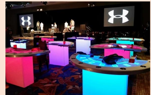
Glow Casino Tables