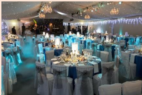
Event Design & Production