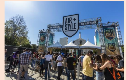
Outdoor Events & Printing

With over 25 years' experience please call to see what we can do for you