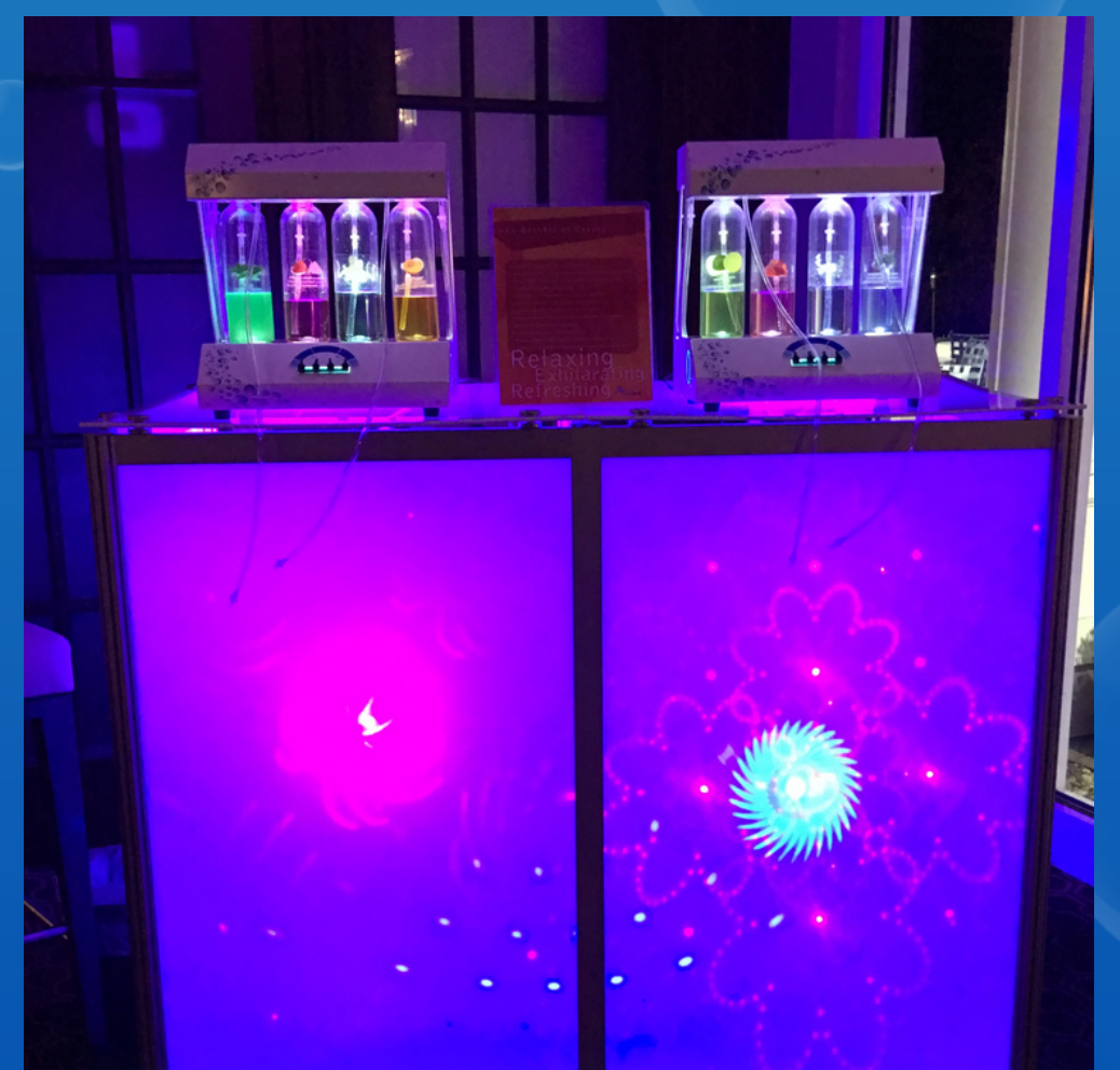
DOES YOU GOOD